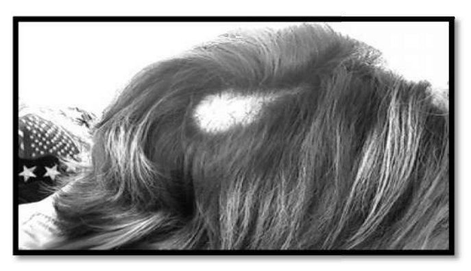
Fig. 3. Trichotillomania-Hair PullingFig 4: Hair pulling causes baldness

Generally hairs are hauled out one-by-one. Frequently pullers pull hairs that are specific shading (e.g., dim) or that are considered "strange" (e.g., "That hair shouldn't be there!"). Truth be told, more than half of pullers specially pull hairs having notable textural qualities, for example, wiry, flimsy, coarse, thickset, or unusual (Christenson et al., 1991, Mansueto. 1990). The muddlings originating trichotillomania are noteworthy. Notwithstanding nonessential loss of hair, there can be scarring or disease (particularly if instruments, for example, tweezers are utilized to cull hair from under the skin). Some proof pulling of long term may prompt textural and shading changes in the hair itself. A few people eat the hair that they pull, and this may