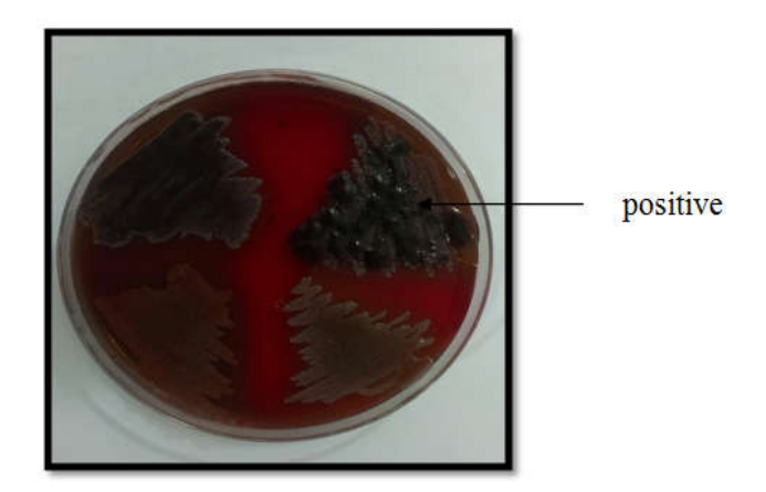
Fig. 2. Congo Red Agar (CRA) assay for bacterial isolates of P. aeuroginosa isolated from burn. Positive is black colonies with dry crystalline (slime producers).

Results growth of 42 isolates of P. aeuroginosa from burn on CAR agar was 3(7.14%) of 42 isolates gave black colonies with a dry crystalline as positive results (slime producers) as a figure (2). The results of genetic techniquesshowed 3(7.14%) gave positive isolates of P. aeruginosa while 39 (92.85\%) gave negative isolates of P. aeruginosa as a Figure (3).