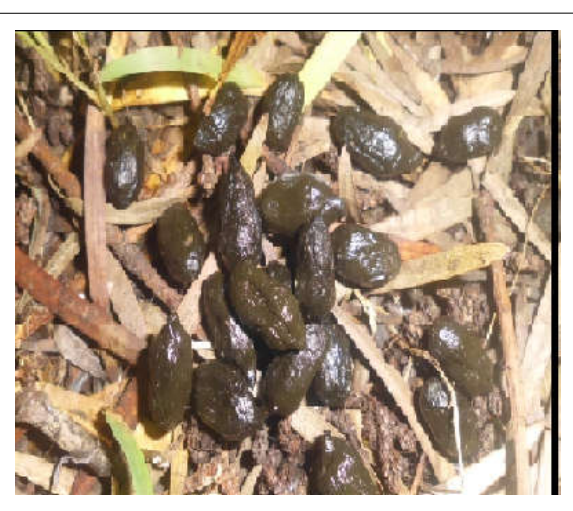
Figure 3b. Scat of Menelik's bushbuck