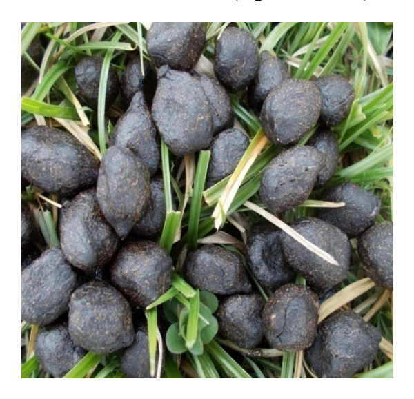
Figure 3a. Scat of mountain nyala

In addition to our vegetation sampling, we recorded the number of scat piles deposited by mountain nyala and Menelik's bushbuck in the 10-m<sup>2</sup> center plot and 100-m<sup>2</sup> outer plot as a proxy for habitat use during the wet and dry seasons respectively. A scat pile was defined as having 10 or more pellets grouped. Mountain nyala and Menelik's bushbuck scat were distinguished by their shape and size. The scat pellets of mountain nyala is conical shaped and pointed at one end and has relatively higher diameter than that of smaller, elongated pellets of the Menelik's bush buck (Figure 3a and 3b).