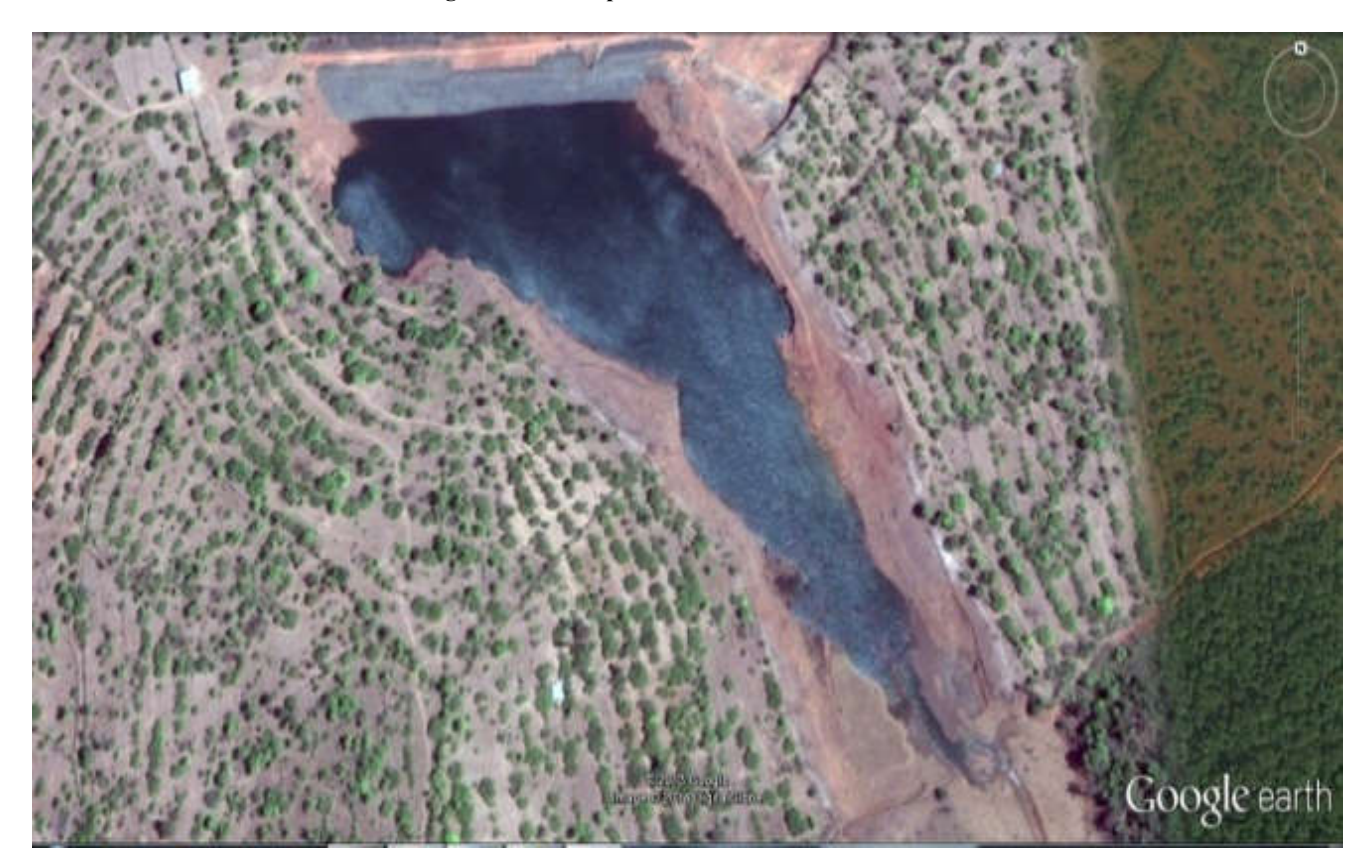
Figure 2. Google map of Gavase freshwater reservoir