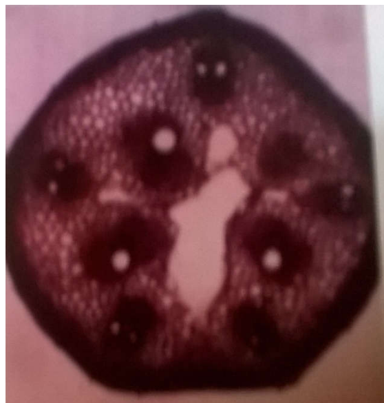
Fig. 3. T.S. of Stem