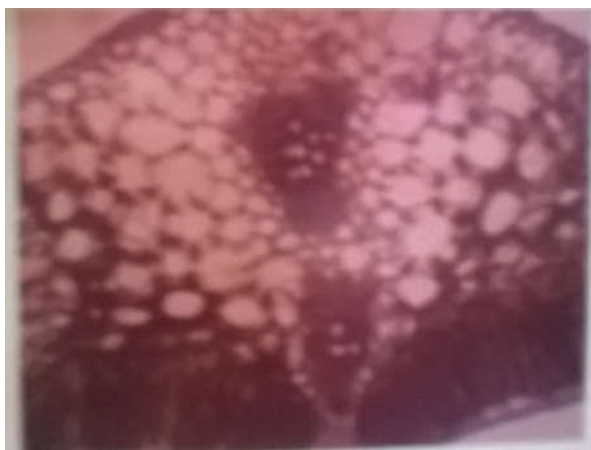
Fig. 2. T.S of Leaf