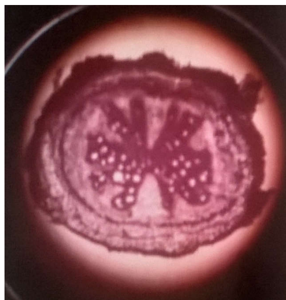
Fig. 4. T.S of Root