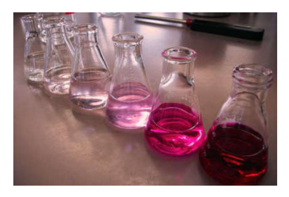
Fig. 2. Titration of citric acid using phenolphthalein produced by Aspergillus niger

The citric acid produced by Aspergillus niger was titrated against phenolphalein as an indicator. The pale pink was produced was showed in Fig 2.