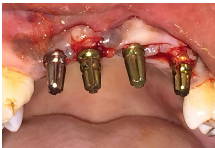
Fig.3. BCS implants placed