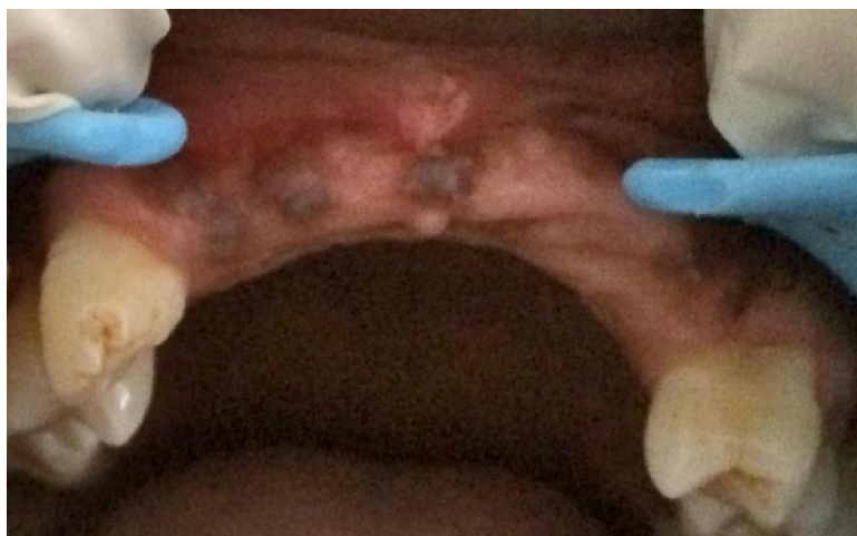
Fig.1. Pre operative view showing atrophic maxilla with missing teeth