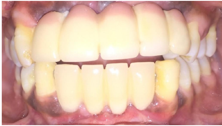
Fig.4. Immediate implant loading