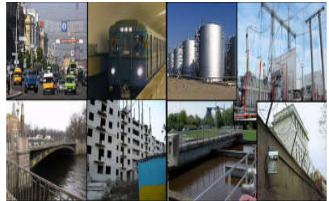
Figure 1. Applications of camera surveillance systems

Dept of E&TC, Government College of Engg, Jalgaon, Maharashtra