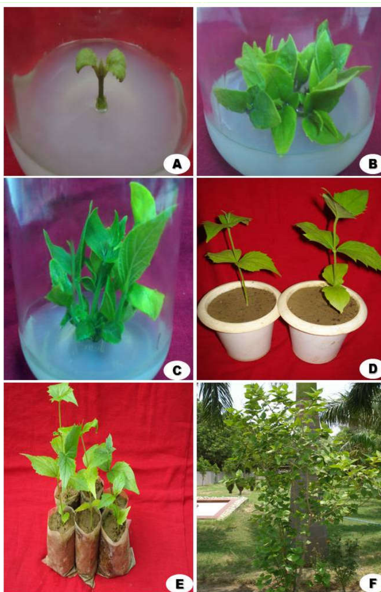
Figure 2 (A-F): In vitro establishment and direct regeneration in Nyctanthes arbor-tristis (L.) using shoot-tip explants. (A) Shoot-tip explant cultured on MS medium supplemented with 1.0 mg/l -1 BAP after one week. (B) Shoot multiplication on MS medium supplemented with 1.0 mg/l -1 BAP + 0.3 mg/l -1 NAA and 50 mg/l -1 putrescine after 6 weeks of culture. (C) Elongation of regenerated multiple shoots on MS basal medium + 0.5 mg/l -1 GA 3 for additional two weeks. (D) In vitro rooted plantlets transplanted in the thermocups containing mixture of soil, sand and vermicompost (1:1:1). (E) Acclimatized plantlets in polybags containing natural soil. (F) Hardened plants of Nyctanthes arbor-tristis (L.) established under field conditions