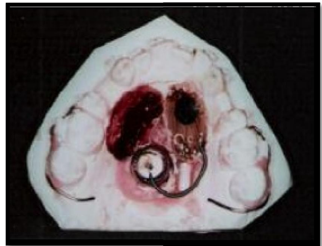
Figure 2. Electromagnetic device used for pulsed electromagnetic field

Effect of Direct electric current on tooth movement: According to Davidovitch, mechanical stress induced electric potential in the bone may be signal to activate the cells that participate in the remodeling process. Also, the electrical stimulation in conjunction with mechanical force can increase the rate of tooth movement (Maheshwari, 2015). Kim et al revealed that electric current was capable of accelerating orthodontic tooth movement (Long, 2013). This technique was tested only on animals by applying direct current to the anode at the pressure sites and cathode at the tension sites, thus, generating local response and acceleration of bone remodelling. Further, development of the direct electric device and the biocatalytic fuel cells is needed to be done so that these can be tested clinically (Nimeri, 2013).