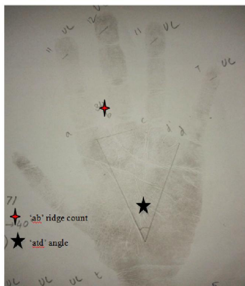
Fig. 1. Right hand impression showing 'atd' angle and 'ab' ridge count

The standard Indian ink method (Cumins and Midlo) was used 1 . The hand pre-smearred with ink was rolled on the paper placed over a round bottle to get the palm print. The rolled finger prints were taken by the rotation of fingers. Finger and palm prints of both right and left hands were obtained and the following patterns were noted: Ulnar loop, Radial loop, Arch, Whorl (double loop, spiral). Total Finger Ridge Count (TFRC), ab ridge count and atd angle were measured, (Fig. (1) & (2)) (Schaumann and Alter, 1976). The subject's IQ level were identified using Raven's Standard Progressive Matrices (2003) and categorised into five grades and grouped as A and B. Group A – grade I and II and Group B – grade III, IV and V. Chi-square test was used to compare different finger print patterns with different groups of students with varying IQ level. Paired-T test was used to compare the means of 'ab' ridge counts, 'atd' angle and Total Finger Ridge Counts (TFRC) of both right and left hands.