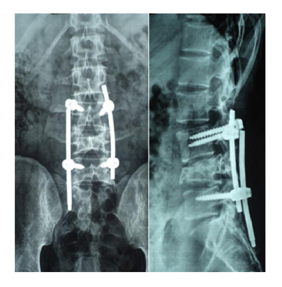
Figure 3. Plain X ray AP and lateral of lumbosacral spine shows the loosening of rod in one patient at final follow up (3 years).

The change in vertebral height was measured by comparing the fractured vertebral body height with that of adjacent normal vertebra. Preoperatively vertebral body height reduced to 60 % of the normal vertebra, it was restored to 81% (60-88%) postoperatively. Some complications were encountered in the series till final follow up. Breakage of screw was reported in one case, loosening of rod in one case (Fig. 3), there was superficial surgical site infection in five cases. Three cases of infection responded to intravenous antibiotics while in two cases surgical site lavage was also done, all wounds healed subsequently.