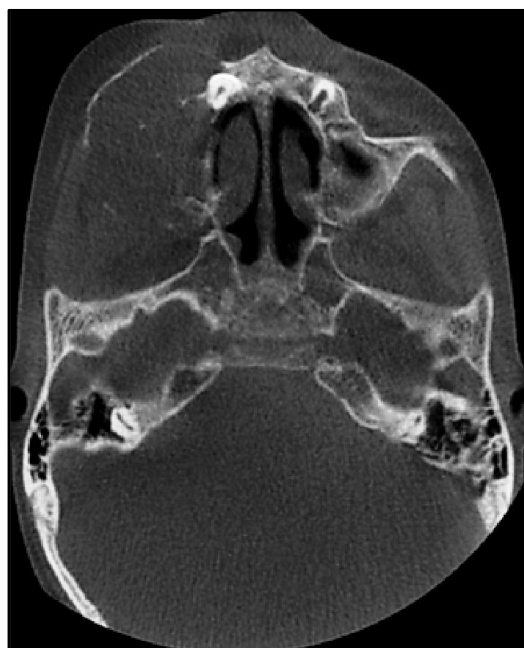
Fig. 3. CT-Axial view showing labial and buccal expansion

A computed tomography showed a large mass involving the right maxillary sinus with destruction of bony margin of the anterior and lateral right maxillary sinus wall. (Fig. 2,3,4).