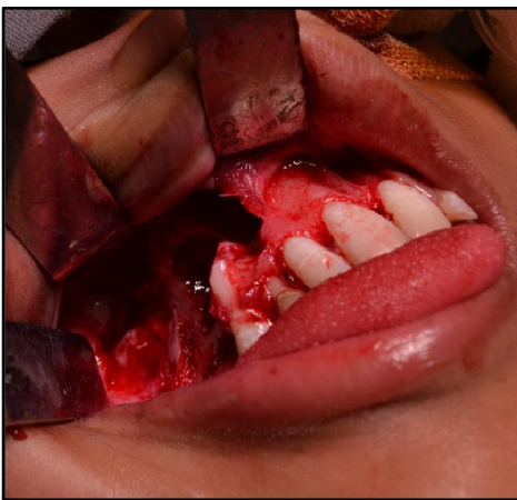
Fig. 7. Removal of the tumour