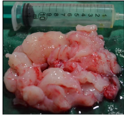
Fig. 9. Gross specimen showing a white gelatinous mass