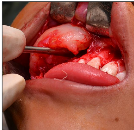
Fig. 6. Encapsulation of the tumour mass