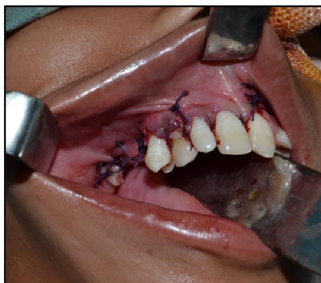
Fig. 8. Closure of the lesion