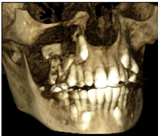
Fig. 2- Computed tomography showing a large mass involving the right maxillary sinus with bone destruction

A computed tomography showed a large mass involving the right maxillary sinus with destruction of bony margin of the anterior and lateral right maxillary sinus wall. (Fig. 2,3,4).