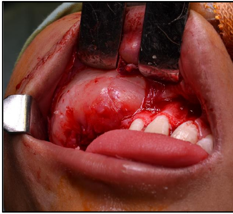
Fig. 5. Intra-operatively, surgical exposure of the tumour mass