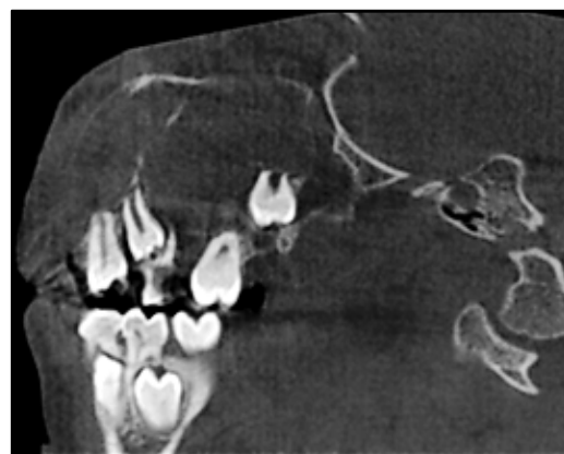
Fig. 4. CT-Sagittal view showing multiple impacted teeth

Based on the clinical findings. A benign odontogenic tumor was considered. The incisional biopsy was taken. The Histopathological report was no conclusive and hence the treatment was decided for Enucleation and curettage. The patient was prepared for all investigations. Surgery was planned under general anaesthesia. Patient was scrubbed and draped in routine surgical manner, crevicular incision was taken with two releasing incision, mucoperiosteal flap was reflected and tumor mass was exposed. (Fig.5) There was a definite delineation between tumor mass and the mucosal layer; hence it shows encapsulation of tumor mass within the bone. (Fig6) The entire tumor mass was removed and curettage was done. (Fig7,8) The tumor mass was sent for histopathological examination. The macroscopic appearance of tumor mass was grayish-white, glistening, firm, mucoid surface with semi-gelatinous consistency. (Fig9) Histopathological findings of OM tumor was loose, abundant mucoid stroma which contains rounded, spindle-shaped cells. (Fig10) The tumor cells are evenly spaced within a fine fibrillar mucinous matrix. Fewer amounts of collagen fiber and inflammatory infiltration was rarely seen.