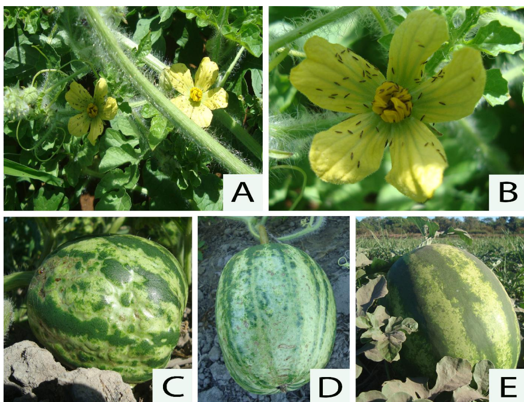
Figure 2 - Thrips infestation in watermelon flowers in commercial plantation in the municipality of Porto Nacional/TO. (A and B) Watermelon flowers and branches with thrips, (C and D) fruit indirect damages caused by thrips at virus transmission and (E) watermelon fruit.

distributed on all continents and found mainly in tropical climates, with probable center of origin in South America (hoddle et al. , 2012). This species is polyphagous, with records in Brazil in several crop plants and weeds (Lima et al. , 2013; Lima et al. , 2000). In watermelon, it has economic importance for causing direct damages, while feeding on the plant tissue, and indirect damages caused by virus transmission (Leão et al. , 2014). According to the report of Nagata et al. (2002), F. schultzei , has a high affinity in the transmission of viruses Groundnut ringspot virus (GRSV), with 93% in transmissibility of scallion plants.