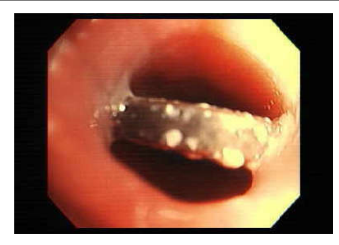
Figures 5. Endoscopic view of coin in UES