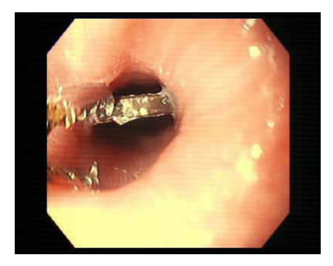
Figures 6. Endoscopic retrieval of coin by forcep