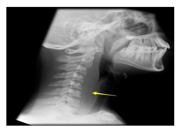
Figure 1. Yellow arrow indicate site of Fish bone location

Esophagus was the most common site of FBs trapping (44/57) followed by Oropharynx. In esophagus, most common sites were upper esophagus, 38.5 % followed by Middle esophagus 24.5% (Table 3). Diagnosis of FB trapping was made using patients' history and witnesses of FB ingestion in most cases. However, X-ray was required to determine the exact location in all cases.