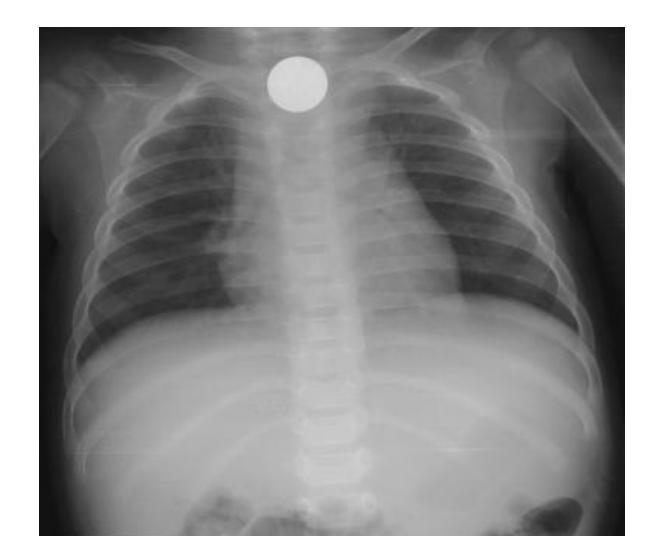
Figure 2. X Ray neck (AP View) showing Coin in upper esophagus