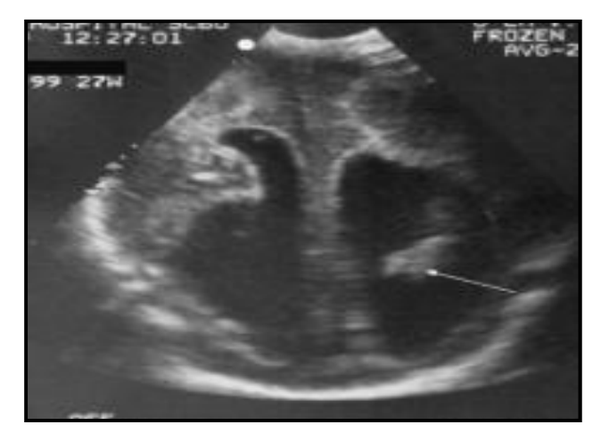
Figure 1. Ultrasound scan of premature neonate, showing marked hydrocephalus with intraventricular hematoma

and third ventricle morphology, intraventricular masses and periventricular leukomalacia Fig (1).