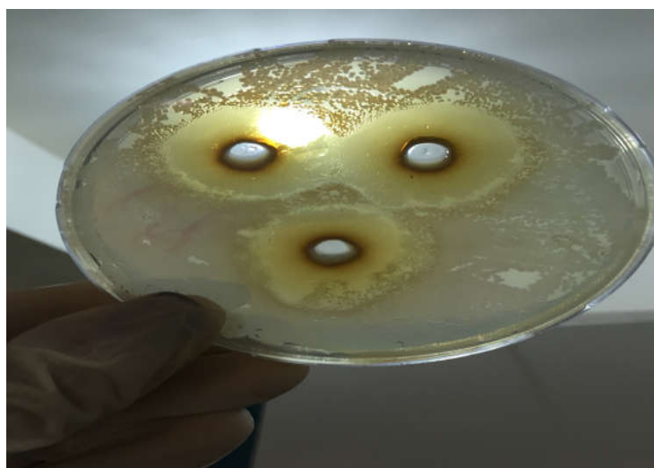
Figure 1. Inhibition zone of extract Prunus armeniaca seeds against bacteria