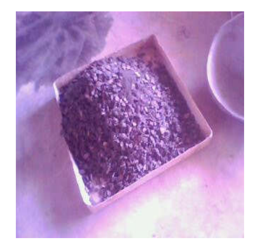
Plate III: Showing segregation of mix ratio 1:2:4