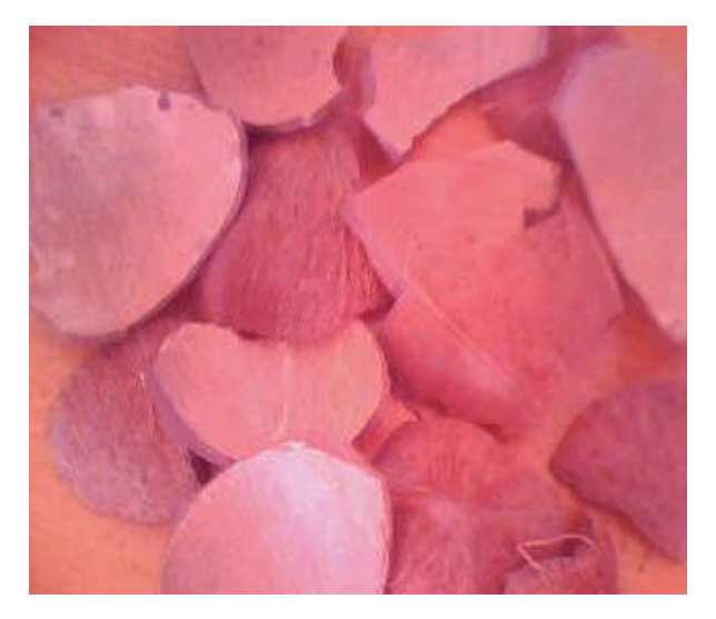
Plate I: Coconut shell aggregate before crushing