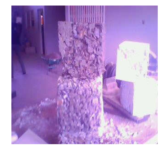
Plate IV: Showing the cubes from mix ratio 1:3:3