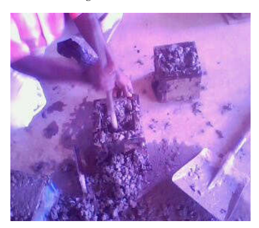
Plate V: Showing mix ratio 1:1:1 preparation in progress. Plate VI: Showing specimen being casted into mould for mix ratio 1:1:1