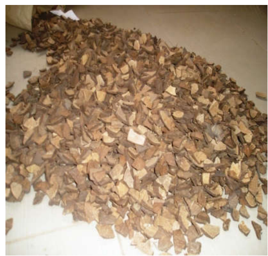
Plate II. Machine crushed Coconut shell aggregate