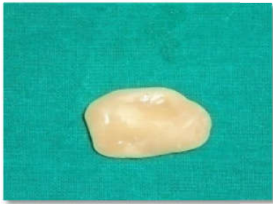
Fig 6. Sclera wax

were achieved in open and closed positions. Final sclera wax pattern was evaluated for fit, contour, esthetics and comfort of the patient (Fig.7).