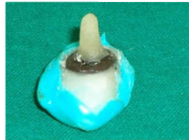
Fig.11. Acrylic stump