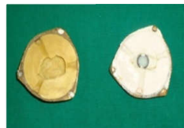
Fig.12. Investing and dewaxing

After the trial of wax pattern the secondary cast was obtained and invested in flask by using dental gypsum in a two piece brass flask (Fig.12). The second pour was poured in such a way that the handle attached to the iris was fix into the plaster of the counter flasking. The flask was then placed in a dewaxing bath for 20 min. Acrylic stump or handle attached to iris will prevent displacement of iris during dewaxing procedure (Kirti Somkuwar et al. , 2009). Tooth colored heat