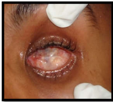
Fig. 2. Enucleated eye socket

On examination, intraocular tissue bed was healthy with intact ocular musculature and proper residual movements (Fig 2). Evaluation of the muscular control of the palpebrae and the internal anatomy of the socket in resting position and full excursive movement was performed. Mobility of the posterior wall of the defect was assessed. Condition of conjunctiva, depth of fornices, and presence of cul de sac was noted. Adequate depth between the upper and lower fornices was also present which will help in retention of the ocular prosthesis.