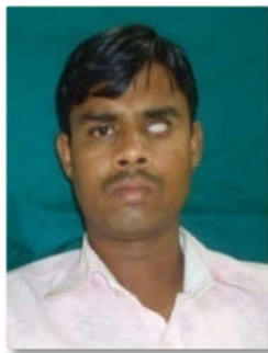
Fig. 7. Sclera wax pattern trial