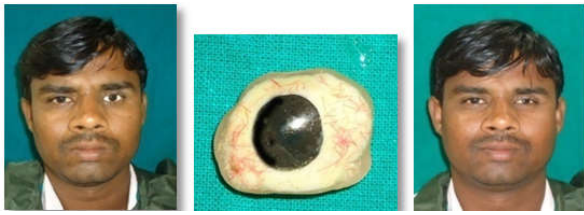
Fig. 13. Acrylic Painting Of Sclera

cured polymethylmethacrylate resin was used for packing to simulate the shade similar to that of normal eye sclera (Mc Arthur, 1977).