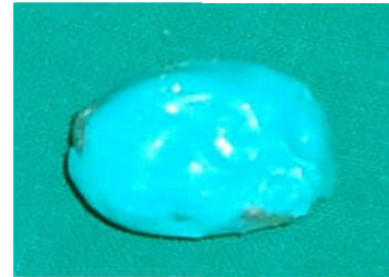
Fig.10. Relining of wax pattern

for symmetry and function. The wax try-in moved and synchronized in harmony with the patient's natural eye movements. This gave a realistic feeling and confidence to the patient. Once iris positioning was finalized, Relining of wax pattern was done by using light body polyvinyl siloxane elastomeric impression material (Fig.10). Acrylic stump or handle (Fig.11) was made which was attached to iris along with wax pattern (Kirti Somkuwar et al. , 2009).