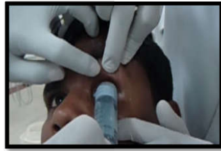
Fig.3. Impression making for eye socket

The patient's eye socket was coated with a thin layer of Vaseline and an impression was made using irreversible hydrocolloid impression material (alginate) (Fig.3 &4).