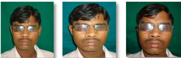
Fig. 8. Iris Positioning In Wax Pattern