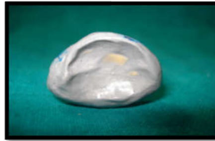
Fig. 4. Recorded impression of ocular defect tissue bed