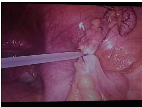
Fig.2. Ligation of base with endoloop

After the operation all of the patients were NPO and received antibiotics for 48 hours. The routine analgesic used for patients was morphine (5 mg intramuscular, every 8 hours). Soft diet was started after 24 hours and patients were discharged after normal diet was tolerated. Post operation follow up visits were in weeks 1, 2 and 4. Patients were asked to contact the therapy team in case of any abdominal problem.