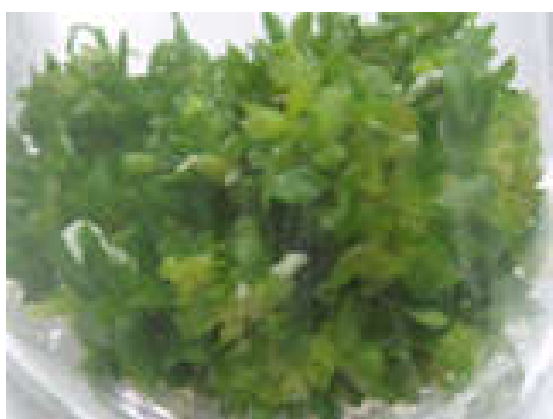
Figure 3. Bud multiplication on medium MS + BA (0.75 mg/L) + coconut water (10 %)