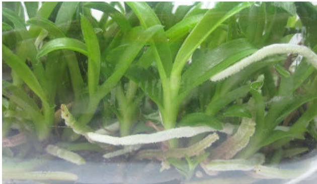
Figure 5. Root creation on medium MS + IAA (0.5 mg/L) + coconut water (10%) + activated charcoal (1 g/L)