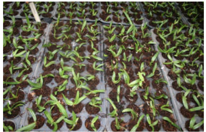
Figure 6. Two-month-old tissue culture tropical Mokara Fullmoon

The mokara (and Renanthera) orchid are rapidly multiplied by the flower-stalk culture technique on MS + BA (1 mg/L) + coconut water (10%) + PVP (50 mg/L) and multiply on MS + BA (0.75 mg/L) + coconut water (10%) (Table 6) (Figure 6). The number of shoots regenerated through flower-stalk did not differ between genotypes. Mokara genotypes that produced bud growth were significantly higher than those of the Renanthera genotypes.