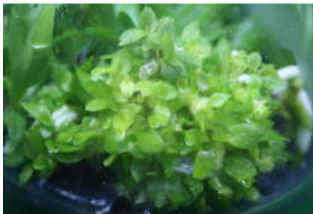
Figure 2. Bud formation on medium MS + BA (1.5 mg/L) + coconut water (10 %)