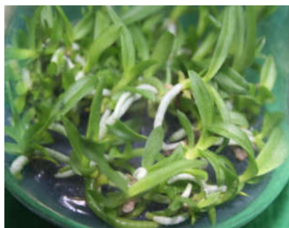
Figure 4. Shoot buds regeneration on medium MS + coconut water (15 %) + Activated charcoal (1 g/L)