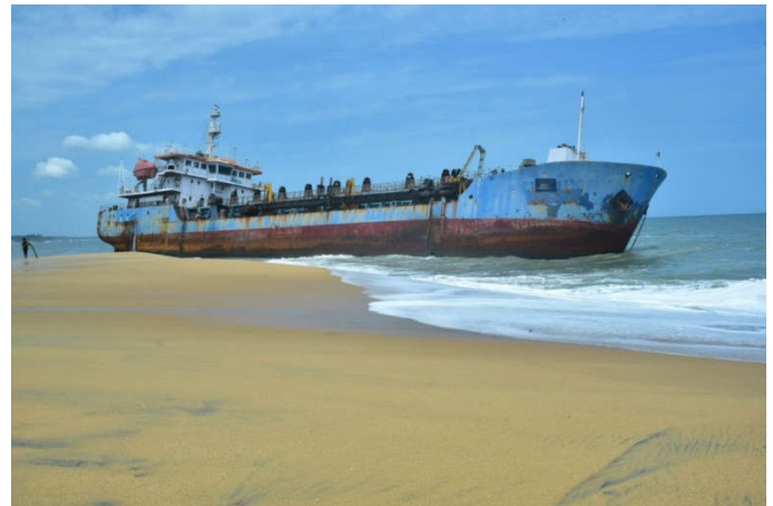
Figure 1. Dredger HANSITA V washed up on Mundakkal Coast

primarily made up of crustaceans, mollusc and crabs (Gollasch, 2002). Chambers et al (2006) pointed out that where niche areas are available on the substrate, higher fouling organism may settle ahead of other species.