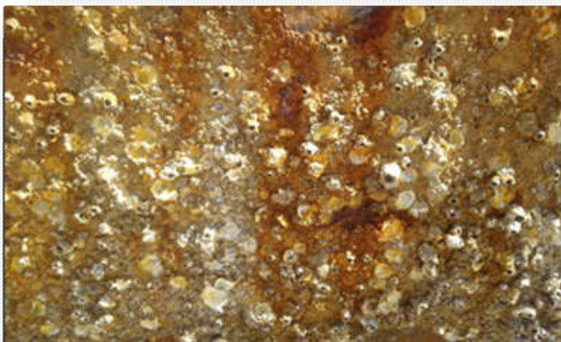
Figure 3. Biofoulers attached on the hull