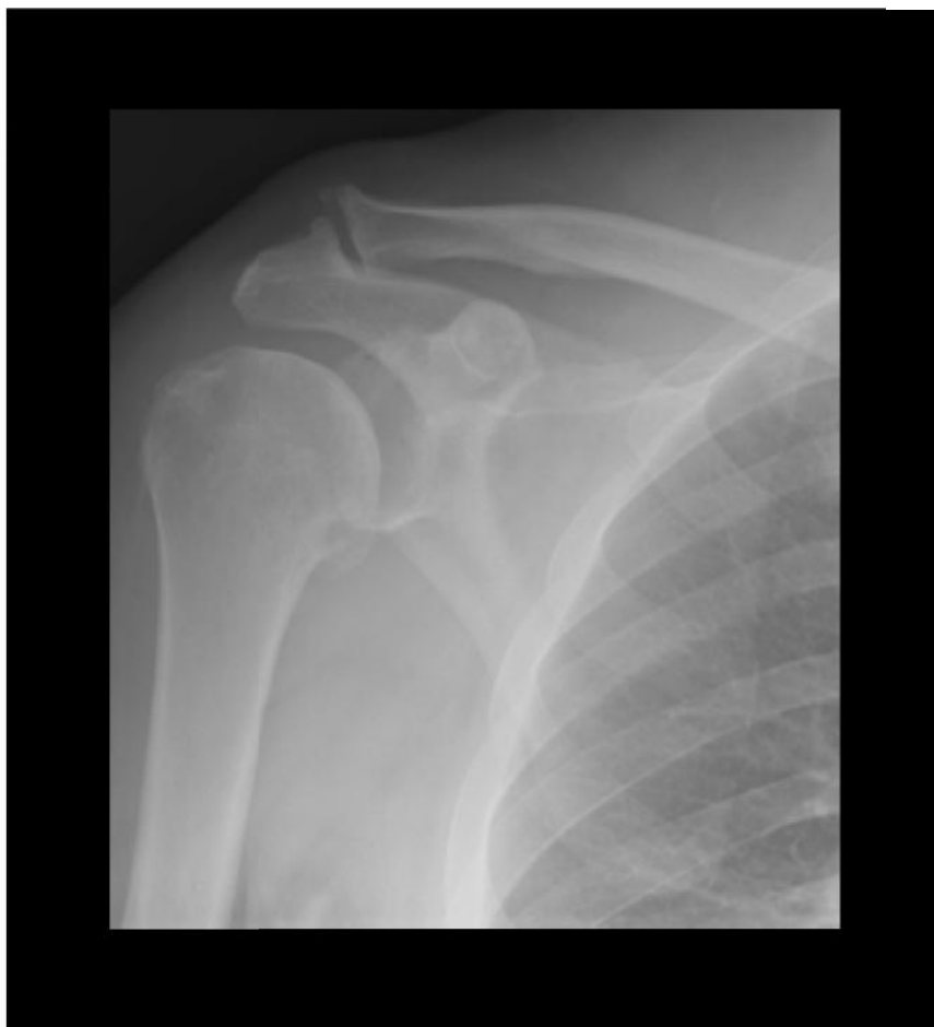
Fig. 1. x ray of right shoulder shows degenerative changes and widening of sub acromion space indicate of possible intraarticular collection

Post-op, he had persistent spikes of fever 38.7.C, drain had 20 cc turbid discharge. Intra operative culture showed no growth over 48 hours. Infectious disease was then consulted and advised to do a full septic screen, serology Hep B, Hep C and HIV, Brucella antibody titre, AFB, and microbacterial culture.