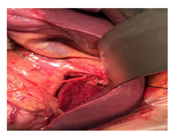
Figure 3. Operative picture showing the caudate lobe tumor and caudate lobe artery