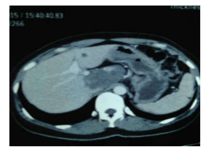
Figure 2. CT scan showing the caudate lobe tumor