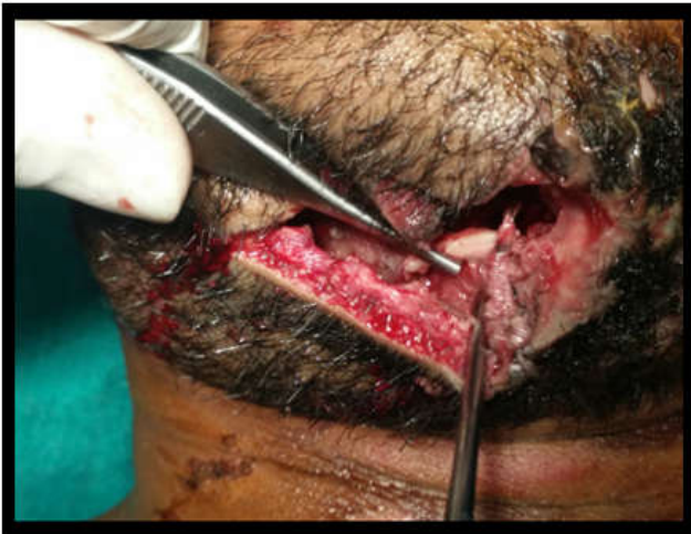
Fig.2. Removal of the bony fragments