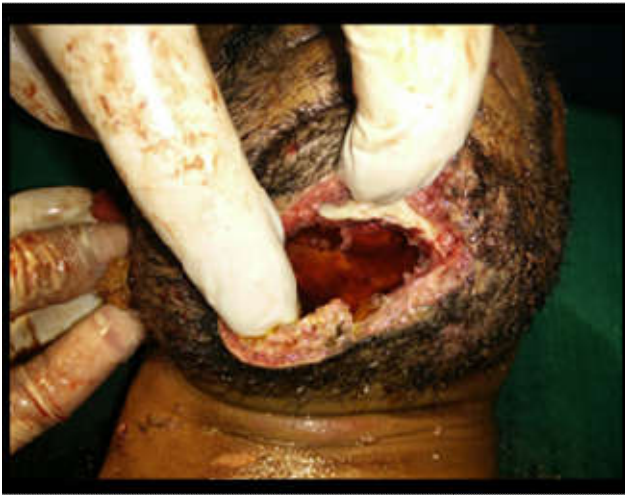
Fig.1. Exit point of the Bullet

The wound was then closed in 2 layers using 3-0 vicryl sutures and 3-0 mersilk for skin closure.