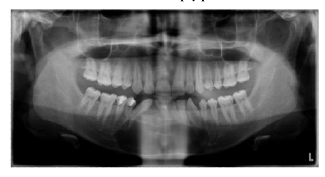
Case 1. Orthopantomogram