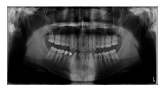
Case 1. Complete bone healing at 12 months