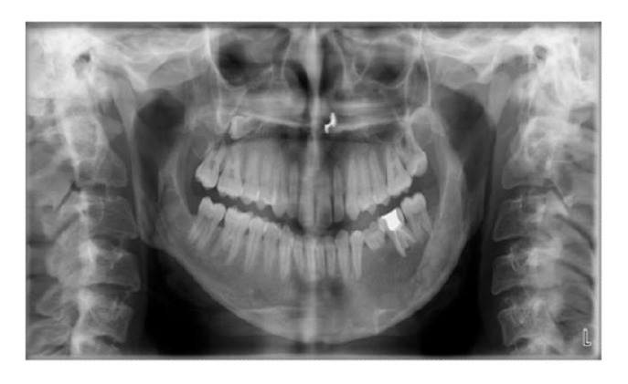
Case II. Complete bone healing at 1 year

OPG X rays were taken every 3 months. In one year the lesion showed complete bone healing (Figure 4a and 4b).