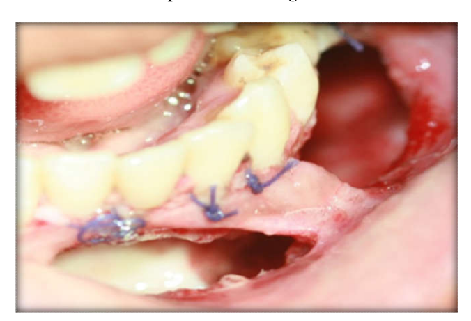
Case II. Incisional biopsy done