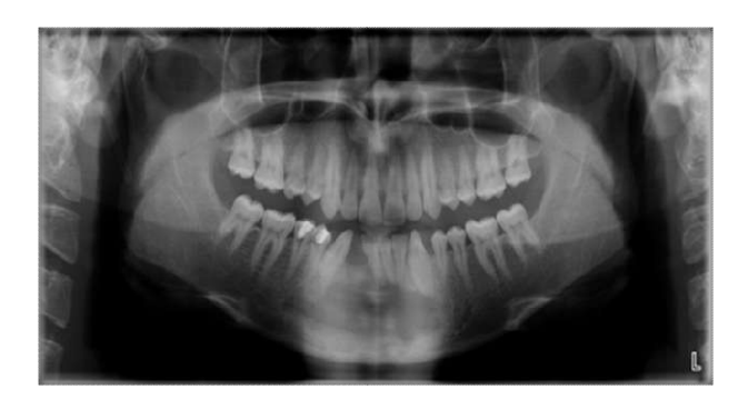
Cae 1. Complete bone healing at 9 months

OPG revealed a large radiolucent lesion extending from right second premolar to left second molar. Incisional biopsy was performed and reported as an infected odontogenic cyst (Figure 3a,3b).