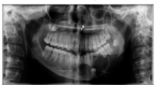
Case II. Orthopantomogram shaory cystic lesion

The lesion was completely enucleated along with primary closure under LA and was sent for biopsy. The excisional biopsy report showed the lesion to be Keratocystic odontogenic tumor (Figure 3c) (parakeratinized type). At that time two windows were made on buccal and labial mucosa and cystic cavities packed with iodoform gauge which were regularly changed. The open packing continued for 2 months after which the bony cavities were completely filled up and only very small self cleansable pouches were left.