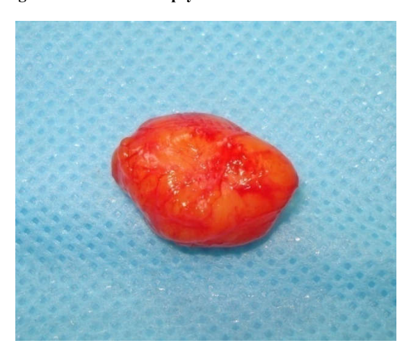
Figure 2. The resected specimen