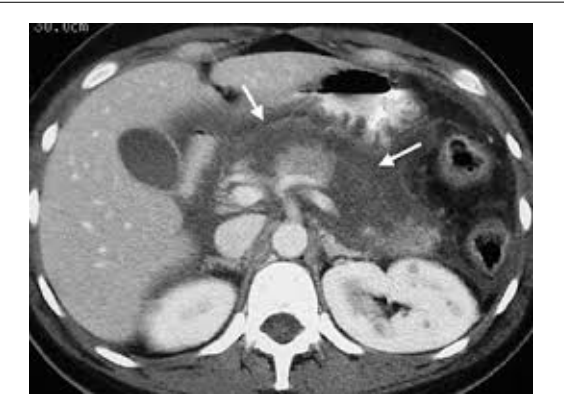
Figure 1. CECT Abdomen (CT index -10)

The patient was kept nil per mouth, NG tube in situ, intravenous fluid therapy with CVP monitoring as there was no oral hypolipediminc drug both startin and fenofibrate started through Ng tube. During the hospital stay, his abdominal pain, triglyceride, and pancreatic enzyme levels did not improve.