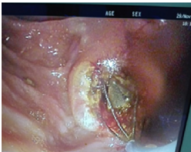
Fig. 1. Endoscopic retrograde cholangiogram showing dilated CBD with medium size stone. Removal of stone was achieved using the basket

Three patients had MRCP as their US examination showed biliary dilatation with normal laboratory level of bilirubin, and in all the three patients MRCP showed floating CBD stones. ERCP was performed at the endoscopy unit with the patient under total intravenous anesthesia in prone position, with 100% cannulation success rate and complete stone extraction in 39 (78.0 %) patients; 7patients (14.0%) revealed no stones. In 4 patients with failed stone extraction because of large stone, a plastic stent was inserted and patients were scheduled for CBD exploration within the next 6 weeks of the ERCP. ERCP was repeated in two cases for removal of plastic stents placed during previous procedures. Cholecystectomy was completed laparoscopically in 49patients. In one patient, laparoscopic cholecystectomy was started and during dissection the cystic duct was avulsed from its attachment near the CBD. We decided to perform an open exploration of the CBD with successful extraction of the stone. Cholecystectomy was completed with closure of the CBD over a T-tube. The postoperative course was smooth in 48 patients. Only two patients had complications in the form of biliary leak.