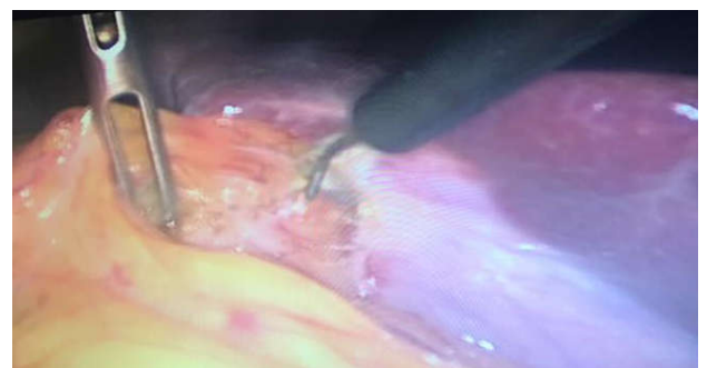
Figure .2. Laparoscopic cholecystectomy after ERCP shows pericholecystic adhesions

Three patients had MRCP as their US examination showed biliary dilatation with normal laboratory level of bilirubin, and in all the three patients MRCP showed floating CBD stones. ERCP was performed at the endoscopy unit with the patient under total intravenous anesthesia in prone position, with 100% cannulation success rate and complete stone extraction in 39 (78.0 %) patients; 7patients (14.0%) revealed no stones. In 4 patients with failed stone extraction because of large stone, a plastic stent was inserted and patients were scheduled for CBD exploration within the next 6 weeks of the ERCP. ERCP was repeated in two cases for removal of plastic stents placed during previous procedures. Cholecystectomy was completed laparoscopically in 49patients. In one patient, laparoscopic cholecystectomy was started and during dissection the cystic duct was avulsed from its attachment near the CBD. We decided to perform an open exploration of the CBD with successful extraction of the stone. Cholecystectomy was completed with closure of the CBD over a T-tube. The postoperative course was smooth in 48 patients. Only two patients had complications in the form of biliary leak.