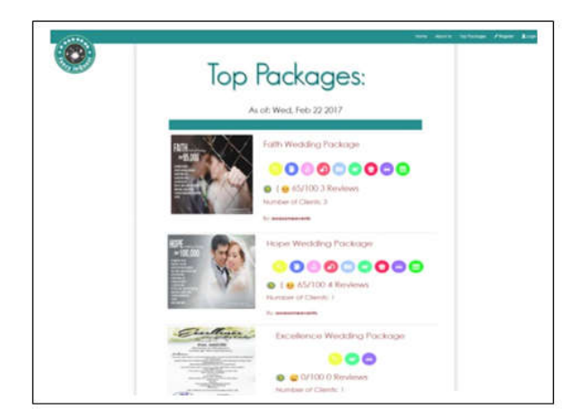
Figure 4. sample search results