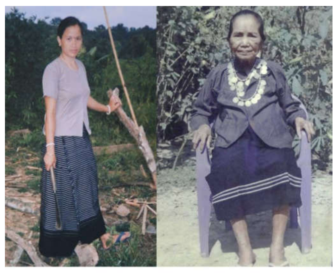
. Rigwnai with all over stripes