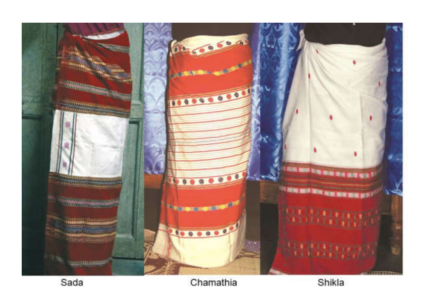
Fig. 1. Sarkar, P., 2013 Types of TradionalTripuri Rignai, India [Photograph]

Rignai of the Tripuriwomen: There are three types of tradioanl rignai worn by the Tripuri Tribe namely Sada, Chamathiya and Shikla. The colour combination of all the rigwnais are in red and white. Motifs are woven using green, blue, yellow and black motifs. At a glance, all the rigwani looked same. However, on a close look, the different types of rigwnai can be identified by the number of colour panels as mentioned on the table below.