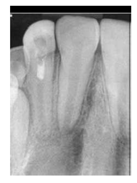
Eight-month recall. Note the resolution of the apical periodontitis and continued development of the root walls and apical closure

Thirdly, young patients have greater healing capacity and more stem cell regenerative potential.