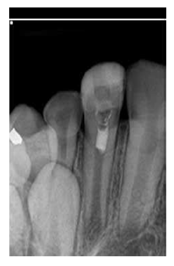
Tooth No. 7 after second visit showing placement of the MTA barrier.

Thirdly, young patients have greater healing capacity and more stem cell regenerative potential.