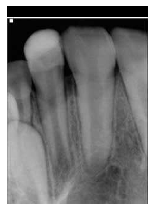
Tooth No. 7 showing incompletely formed apices and apical periodontitis. The patient also presented with pain to percussion and swelling.