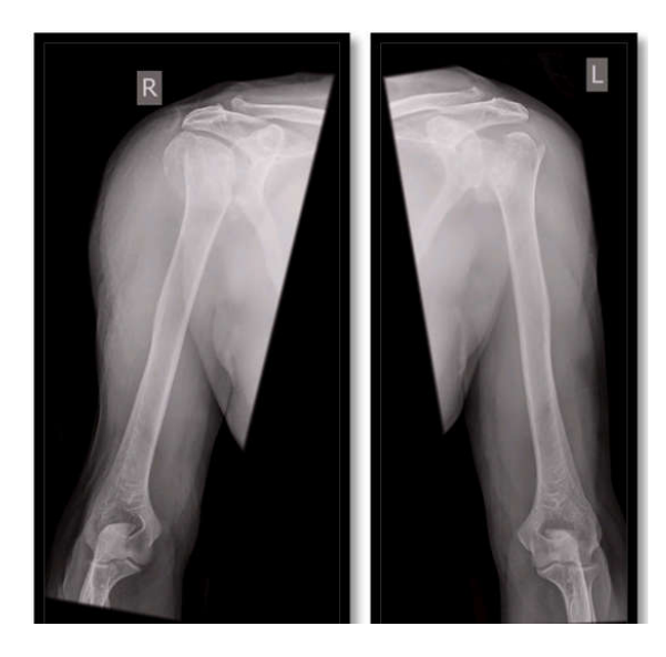
Figure 1. Showsbilateral fracture dislocation of proximal humerus

limbs were normal. A full neurological examination showed no obvious pattern of neurological deficit although limited due to his injury. There were no signs of tongue biting and no other associated injuries. Initial investigations showed normal blood investigations and ECG showed a longstanding left bundle branch block. Upon further investigations for his syncope event a holter monitor showed intermittent profound sinus bradycardia (28 beats/ min) and an MRI showed right parietal cerebral infarct even though he had no neurological manifestations clinically. A carotid Doppler ultrasound, EEG and Echo were all normal with ejection fraction of 55%. With regards to his shoulders X-ray showed bilateral fracture dislocation of the proximal humerus (Fig1) and a CT showed posterior fracture dislocation of bilateral proximal humerus at the anatomical, the right proximal humerus had a fracture at the anatomical neck and Greater tuberosity that was equivilant for neer 2, the left shoulder had fracture at the anatomical neck that was equivalent to neer 1. (Figures 2 and 3). The articulating surface was not damaged by the posterior glenoid. The fracture occurred at the anatomical neck, the head had dislocated posteriorly and the posterior glenoid was pressed against the anatomical neck on both sides (Fig.4).