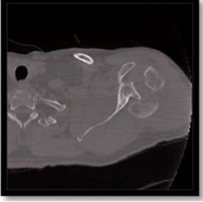
Figure 1. CT image showing intact articulate surface of humeral head