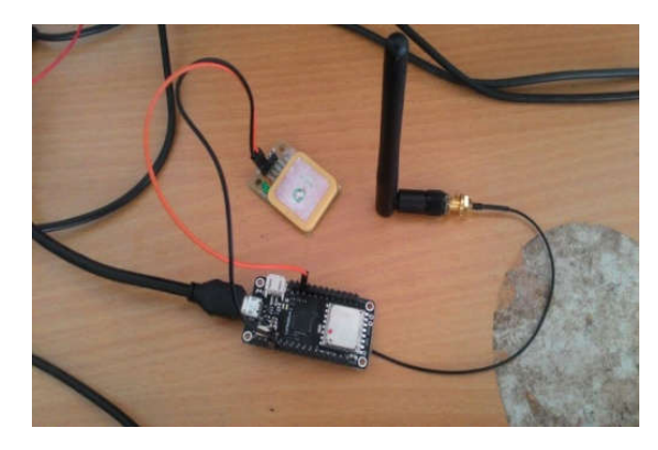
Figure 3. Working of lora

A Semitic innovation, LORA Technology offer a very convincing mix of long range, low power consumption and secure data transmission. Public and private networks using this technology can provide exposure that is greater in range compared to that of existing cellular networks. It is easy to plug into the live infrastructure and offers solution to serve battery BASED ONIOT applications. LORA Technology into its chipsets. These chipsets are then built into the products offered by our enormous network of IoT partners and LPWANs integrated into from mobile network operators worldwide.