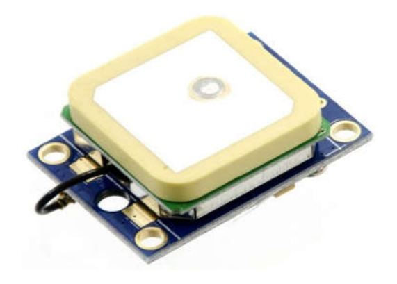
Figure 4. Global Positioning System