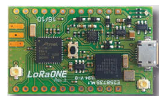
Figure 2. LoRa board

too, through improvements in operations and efficiencies as well as drop in costs. This wireless RF technology is being included into cars, street lights, manufacturing equipment, home appliances, wearable devices – anything, really. LoRa Technology is making world a Smarter