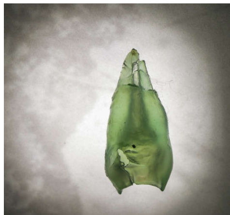
Figure 5. Type IV root canal configuration visualized after insertion of dye

The canal configuration were categorized into seven types by Vertucci in 1984 (7) as follows (Fig 3)