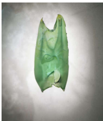
Figure 2. Tooth became cleared after treating with methyl salicylate

Teeth are stored in water or 10% formalin and they are cleaned completely by removing calculus and debris. Access cavities are prepared with round bur and no.8 size file is used to confirm access opening without damaging the root canal configuration and then stored in 5% sodium hypochlorite solution for 48 hours which is changed every 24 hours to remove any organic debris followed by flushing in running tap water and its apical patency is confirmed by emergence of water from apical opening when water is forced through access opening with syringe. The samples are placed in 10% nitric acid for 24 hours and then in 25% nitric acid for another 24 hours for the purpose of decalcification. The completion of decalcification is confirmed by piercing the needle in crown portion followed by flushing in running tap water for 1 hour. The samples are dehydrated by placing the sample in 80% ethanol for overnight followed by 90% ethanol for 1 hour and then in 100% ethanol for 3 times each 1 hour (Fig 2)