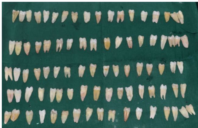
Figure 1. A set of 150 orthodontic extracted teeth

A set of 150 orthodontic extracted permanent maxillary first premolars are randomly collected from Cuddalore district, Tamilnadu (Fig. 1). Teeth with incompletely formed root, caries, restorations and fractured tooth are not included.