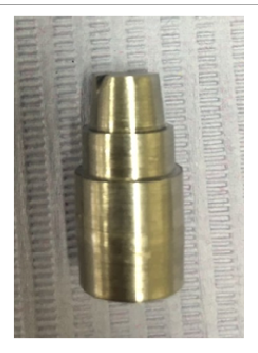
Figure 1. Standardized metallic die used in the study

Mean, standard deviations of measured gap for both groups were shown in table1.Mean \pm standard deviationin (µm) is 109.85(24.71), 115.97 (25.56) in groups I and II, respectively (table1). (p > 0.05). However, the Unpaired t test score is (-3.375) which indicate that there is statistically significance difference in marginal gap between groups I and II (p=0.02) (table 1). (Figure 7):