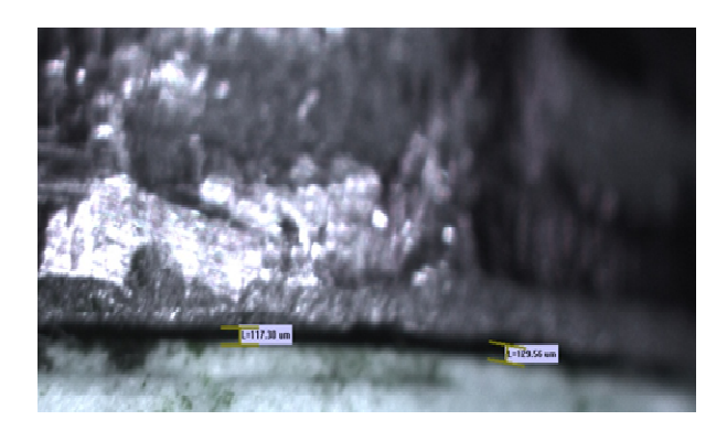
Figure 6. Measurementsof marginal gap using microscop