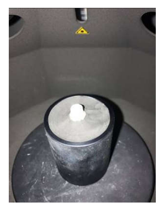
Figure 2. Die was scanned by CERCON scanner