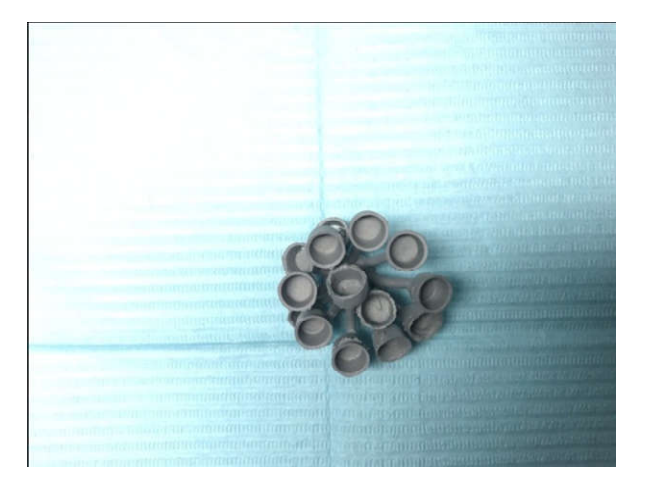
Figure 5. Casted crowns before removing of sprues