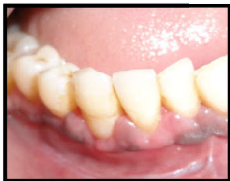
Figure 10. Post operative view after 3 months