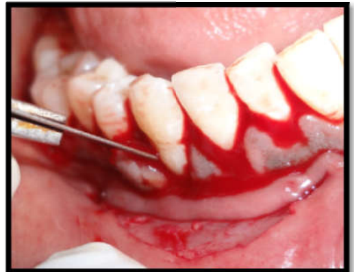
Figure 5. Sulcular incision