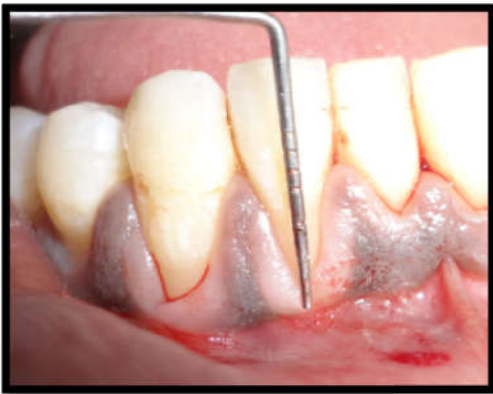
Figure 2. Insufficient width of attached gingiva