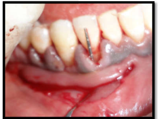
Figure 6. Bridge flap elevated