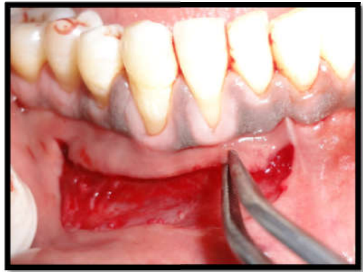
Figure 4. Split thickness flap