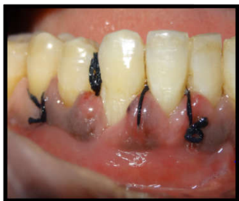
Figure 9. Post operative view after 1 week