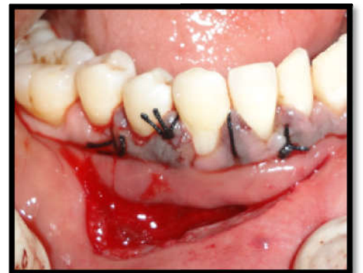
Figure 7. Bridge flap coronally positioned and sutured