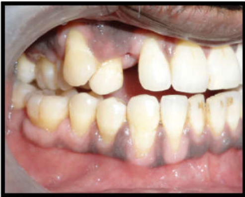
Figure 1. Pre operative view

A male patient aged 38 years reported in the department of periodontics with the chief complaints of hypersensitivity and receding gums in lower right front and back tooth region of jaw. Patient had no relevant medical history and was not under any medication. Clinical examination revealed an inadequate zone of attached gingiva with shallow vestibule. The recession was class II according to Millers' classification in relation to 42, 43 and 44 region. The recession was about 4mm in relation to 42, 43 and 3mm in relation to 44. Intraoral periapical radiograph in relation to 42, 43, and 44 revealed adequate bone supports in interdental areas. The width of attached gingiva was 2mm on 42, 43 and 44. Bridge flap technique was planned for root coverage in 42, 43 and 44. The surgical technique was explained to the patient and informed consent was obtained. Scaling and root planning was done prior to surgery.