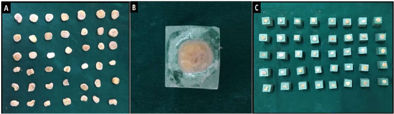
Fig. 1. (A) Flat dentin discs, (B and C) Discs embedded in blocks of dental resin.