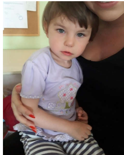
Picture 1. Right hemiparesis cerebral palsy female child with her mother's permission for taking a picture

both hand and fingers, ten fingers all together (TFRC), between triradii a-b, b-c and c-d all together (TPRC) and Atd angles in degrees (ATDDL).