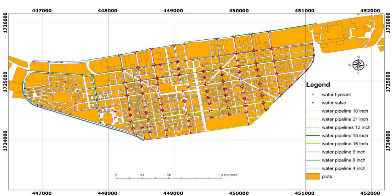
Figure 5. Layout of Khartoum center water network map

The action plan is a continuous procedure of analyzing, improving and applying this management system in most important areas of greater Khartoum and different states of Sudan. An effective action plan of Water Pipelines Monitoring and Management System (WPMMS) for any water supply company such as KSWC needs to include the following: