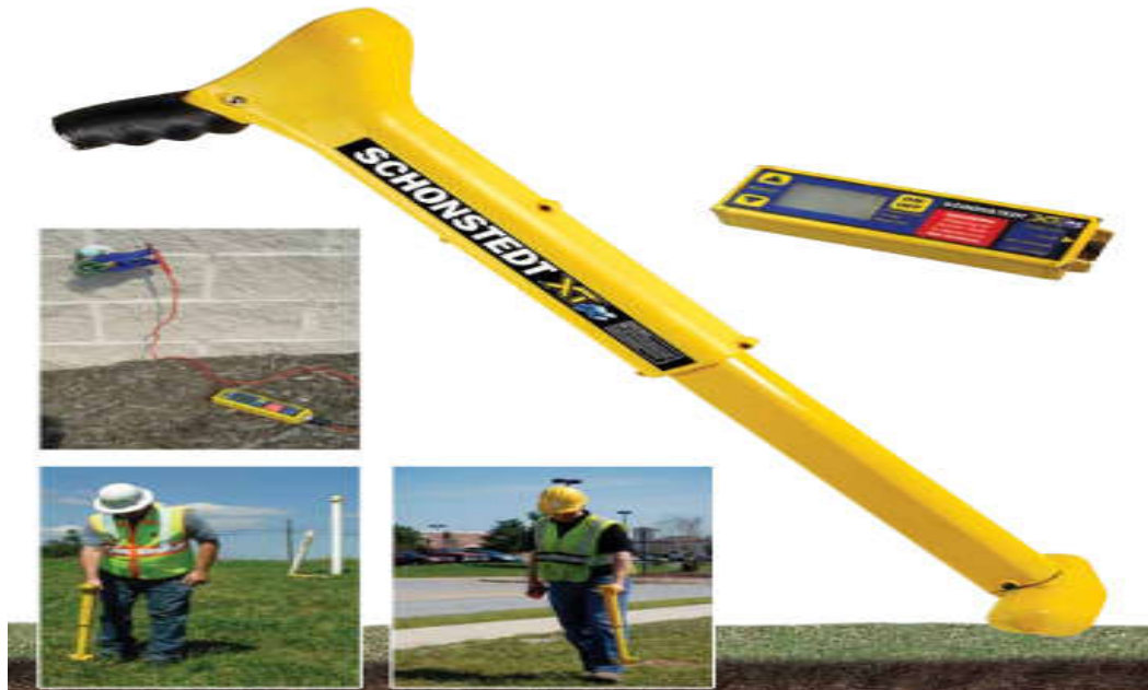
Figure 1. XTpc Pipe and Cable Locator