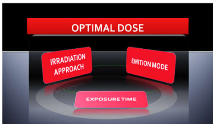
Fig. 2. Schematic illustration of the methodical approach for choosing the optimal dose of laser radiation individually for each patient and for each stage of treatment

The main problem in education on oral laser application on a global scale to date is the lack of a sophisticated methodology that allows a concrete visualization of the results obtained. In recent years, there has been a significant increase in the interest in proving the healing effect of PDT and HELT (Seka et al. , 2007). The vagueness of the mechanism of interaction of light photons at all levels of human body's own biological organization gives rise to uncertainty in laser therapy practitioners. The main problem is the calculation of laser power and energy (Coluzzi, 2008). An objective, randomized system for controlling the curative effect has not yet been established on clinical criteria confirming the proper course of laser bioenergy and bio synergy. The question of the healing power of the laser apparatus is not resolved. No in-depth standardized study on the loss of laser radiation in laser machines with a conductive fiber optic system such as diode lasers has been done. Therefore, a second major postulate in our program is the dependence of the optimal dose of laser radiation on irradiation approach, emit ion mode and exposure time. The training in our laser center is carried out with a lot of prepared patients protocols and methods for building individual therapeutic programs depending on the compensatory possibilities of the body of patients from different compensatory models of clinical situations Fig.2.