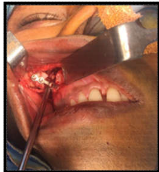
Intra Operative Photographs