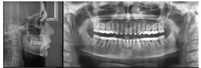
Figure 4. Final stage lateral cephalogram and OPG (before debonding)