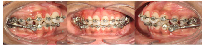
Figure 3. Intra-oral photograph with the powerscope appliance

steel arch wires were inserted after figure of eight ligation from first molar to first molar in both arches with 10° of lingual crown torque was given in in lower anteriors. A fixed functional Class II corrector appliance, the Power scope TM, was placed with more activation on left side to correct the lower dental midline deviation and improve the mandibular retrognathism and achieve Class I relationship on both side (Figure 4). After eight months, the Power scope appliance was removed. Finishing was accomplished with 0.019" × 0.025" TMA archwires and lighter .016" stainless steel lighter with vertical elastics for final settling. Final stage OPG, lateral cephalograms and photographs were taken (Figure 5, 6). Pre-treatment and posttreatment cephalometric readings were compared and superimpositions were made.