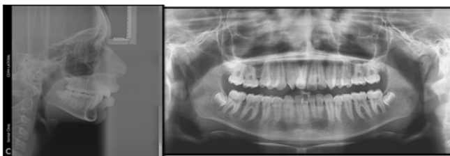
Figure 2. Pre-treatment lateral cephalograms and OPG

Treatment objectives: To correct crowding rotations and maintaining inter-canine and inter-premolar widths, improve facial profile, achieve adequate over jet and overbite relations and to obtain Class I canine and molar relation without extracting teeth.