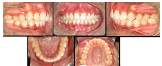
Figure 5. Post-treatment extra-oral and intra-oral photographs