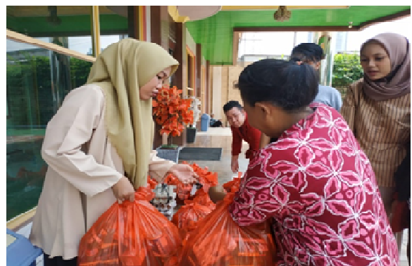
Figure 3. Students' enthusiasm when doing charity

Thesis Results: Thesis is the students' final assignment with results as follows. Based on the final exam results, practice results, and thesis results, it can be concluded that students in STIKES KESOSI have good learning outcomes in the cognitive aspects of the course. Furthermore, the students also improved their attitude and behaviour by learning Local Content courses. These courses developed their concern for others, especially towards parents, brothers, poor people and orphans. In the Indonesian Social Solidarity course, students were required to give donations in every lecture, at least five thousand rupiah, so that each of them will become disposed to help other people. In the subject of Life Sciences, students were taught to behave honestly so that there is a match between their words and their deeds. The public speaking course aimed to make students able to communicate well in public especially in a workplace that deals with patients and society. At the end of the semester the money donated by students to each subject is collected voluntarily and basic needs are purchased for other people. The students donate these materials to people who are entitled to receive them. It can be said that local content courses, aim at changing students' behaviour and attitude as a concern of STIKES KESOSI, was successful. Below is a picture of students distributing basic needs to those entitled to receive them.