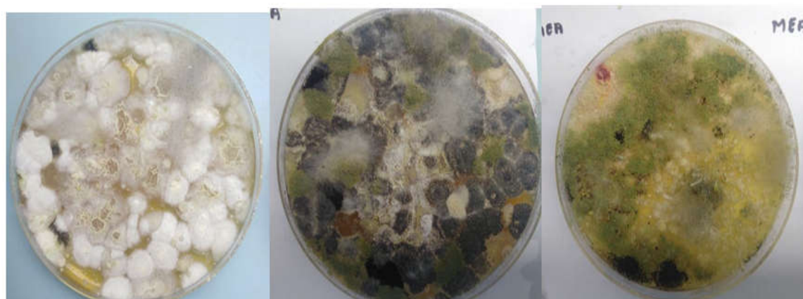
Figure 2. Petri dish with fungal aerial contamination