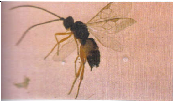
Parasitoid A. taragamae