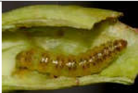
Host larvae: Maruca vitrata