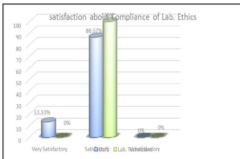
Fig (3) shows that, the lab ethics to obtained a satisfactory level from Medical Surgical Nursing Staff and student Nursing students as indicated by (100%) & (86.67) respectively was satisfied

While majority of them (89.3%) were unmarried. And all of them (100.0%) were newly enrolled in the 2 nd academic year of the faculty. Table(19) indicates that, There was a high statistical significance differences between Medical Surgical Nursing Staff & clinical instructors Students and Lab Technician's Satisfaction Regarding Clinical Lab. Environment at p < 0.001 . While there was a statistical significance differences regarding Compliance of Security and safety precautions inside the lab. at p < 0.05 . While there was no statistical significance differences regarding Lab. Equipment's and resources at p > 0.05 . Table (27) shows that, There was a statistical significance differences between Medical Surgical Nursing Staff & clinical instructors and Student's Satisfaction Regarding Clinical Evaluation Sheet & Quality of Performance Testing at p < 0.05 . as well as Clinical Evaluation Sheet at p < 0.001 .