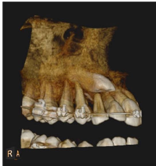
Fig.5 showing 3D reconstruction CT scan crown is placed on the labial aspect and root is placed on palatal aspect, deciduous teeth is also present.