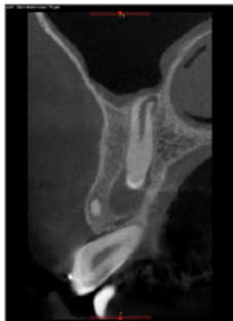
Fig. 3 showing a small breach is also seen in the floor of maxillary sinus along with corticated well defined hypodensity on sagittal CT scan.