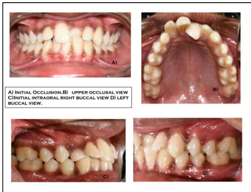
Fig.2 showing A) Initial occlusion B) upper occlusal view, C) intraoral right buccal view, D) left buccal view.