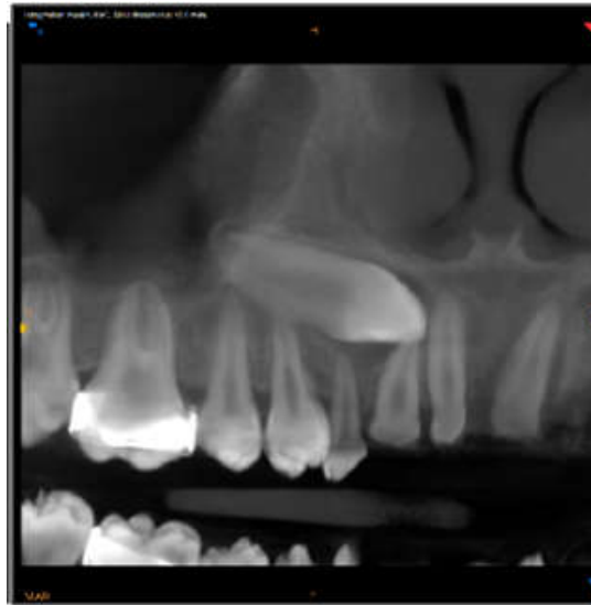
Fig.4 showing crown is enveloped with corticated well defined hypodensity i.r.t Impacted 13 on Axial CT scan.