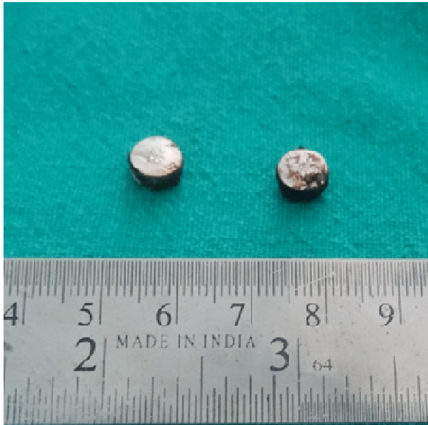
Fig. 2. The foreign bodies (Button cells) after removal

X-ray of paranasal sinuses occipito-mental view was done which revealed radiopaque shadow on both sides of nasal septum in nasal cavity. (Fig. 1). The diagnosis of metallic nasal foreign body was made and the consent for nasal endoscopy under general anesthesia was taken. The child was taken up for emergency nasal endoscopy using rigid nasal pediatric endoscope under general anesthesia. The endoscopy revealed mucopurulent discharge along with dirty brown slough which was sucked out and metallic foreign was visualized which was entrapped between the septum and inferior turbinate and removed with the help of hook and the same was repeated on other side. The removed foreign bodies were button cells (Fig-2). The mucosa of septum and turbinate was ulcerated and slough was present which was also sucked out. After removal of foreign bodies bilateral nasal cavity was irrigated with saline fortified with amikacin antibiotics. The child was put on I.V. amoxiclav for 24 hours and was discharged on oral amoxiclav and normal saline nasal drops. The child made an uneventful recovery.