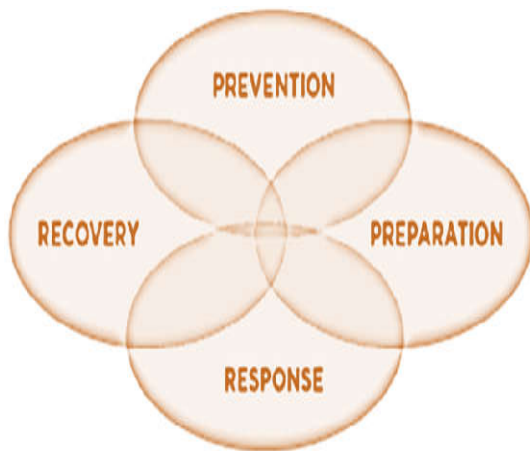
Fig.1. Components of Disaster Management

disaster and warn the people before outbreak of hazards, emergencies like disease, famines, pollution, epidemic, communal riot and political and socio-economic turmoil. Prevention/ mitigation and preparedness are pre disaster management process. It is said prevention is better than cure.