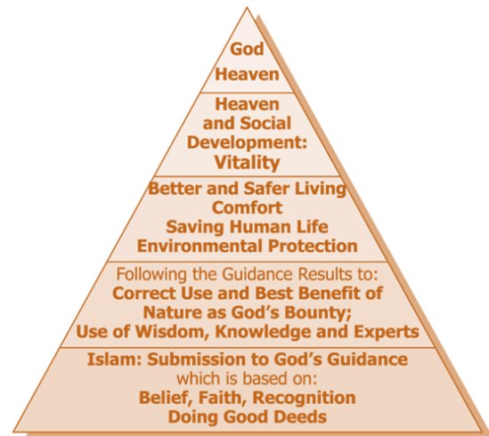
Fig. 2. The process of achieving safety, development, vitality and finally "heaven" by following the Islamic form of God's guidance

It believes in the understanding and exploration of the process of occurrence, evolution of any event and its objectives of existence. Nothing happened at random but follows systems which are to be explored. The benefits of nature could be only achieved through use of wisdom, knowledge, experts, co-operation, community participation and faith and belief in God and His natural law for use of the earth and its environment (Mohsen Ghafory-Ashtiany2009). Two figures below are representing the process of achieving safety, development, vitality and finally "heaven" by following the Islamic form of God's guidance and the process of causing disaster, loss of life and "hell" by not following the Islamic approach to God's guidance and by doing "bad deeds".